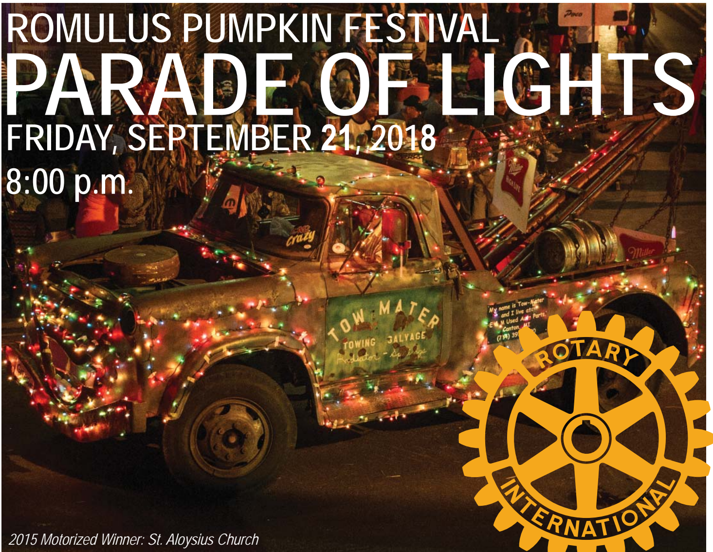
2015 Motorized Winner: St. Aloysius Church

Free for all entries! No preregistration required! Cash prizes for the winner in each category!